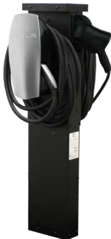
HCS/TESLA® Combo PMD-10T

The PMD-10T has all the same features as the PMD-10, but comes equipped to mount ClipperCreek and/or Tesla® 2nd Generation charging stations.