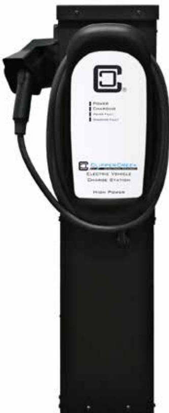
PMD-10R with HCS -60

The PMD-10R is an affordable solution designed for fleet, parking lot, or any harsh environment. Designed to accommodate ClipperCreek HCS, LCS, ACS products as well as the Tesla® Wall Connector. This "ruggedized" mounting solution is an excellent value.